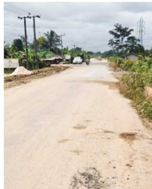
Repair Of Ahoada-Abua-Degema Road, Rivers West Senatorial District, Rivers State (Amount: N100m).

During our tracking exercise, we discovered that some projects had been allocated in the budget two years in a row without implementation. An example is the project domiciled with the Federal Road Maintenance Agency (FERMA), The Emergency Repair of Emohua Tema Junction Road in Rivers State (ERGP12153281). It appeared as a 2020 Federal Consolidated Project and in 2021 with a budget of N15m but is yet to be implemented.