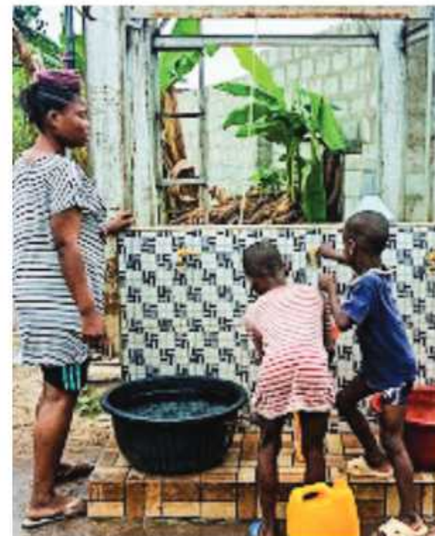
Solar-powered borehole serving Agbala community, Owerri North LGA, Imo state (Amount: N13.5m)

While we continue to clamour for the increase in the nomination of social capital projects in the state, security intervention to safeguard citizens' lives and enable public investments to thrive for economic development is equally critical.