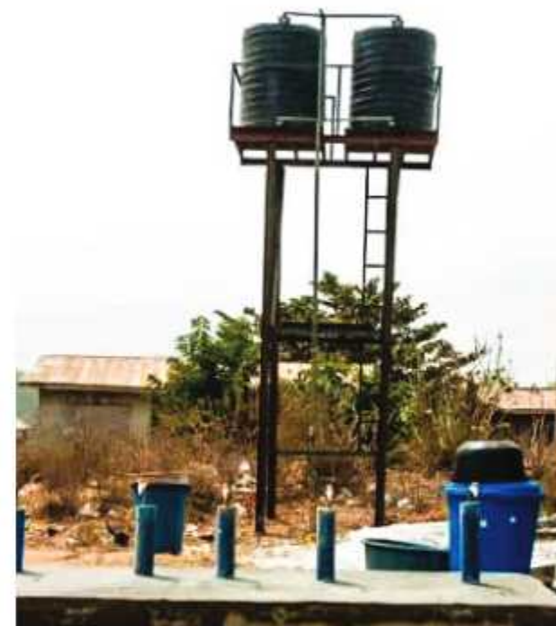
Completed borehole project, domiciled under Ministry of Labour and Productivity, serves the Ohia community, Owan West LGA (Amount: N50m)

Majority of projects were assigned to agencies without the expertise to supervise such projects. For instance, an N100m electrification project—Supply and Installation of 100w All-in-One Solar-powered Street light in Selected Rural Communities in Orhionmwon Uhumwode Federal Constituency, Edo state (ERGP554002586)--was domiciled under the National Directorate of Employment, an agency without the mandate to execute electrification projects.