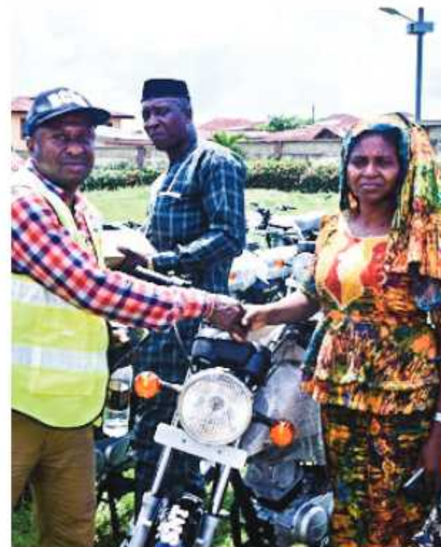
Supplied motorcycles under the Ministry of Defence's supervision (Amount: N50m)

The Ministry of Defence also supervised the supply of grinding machines, sewing machines, and motorcycles in Idanre/Ifedore Federal Constituency and the construction of a skill acquisition centre in Ifedore LGA. Amidst all the security issues plaguing Nigeria, why is the Ministry of Defence saddled with the distribution of sewing machines and construction of skill acquisition centres?