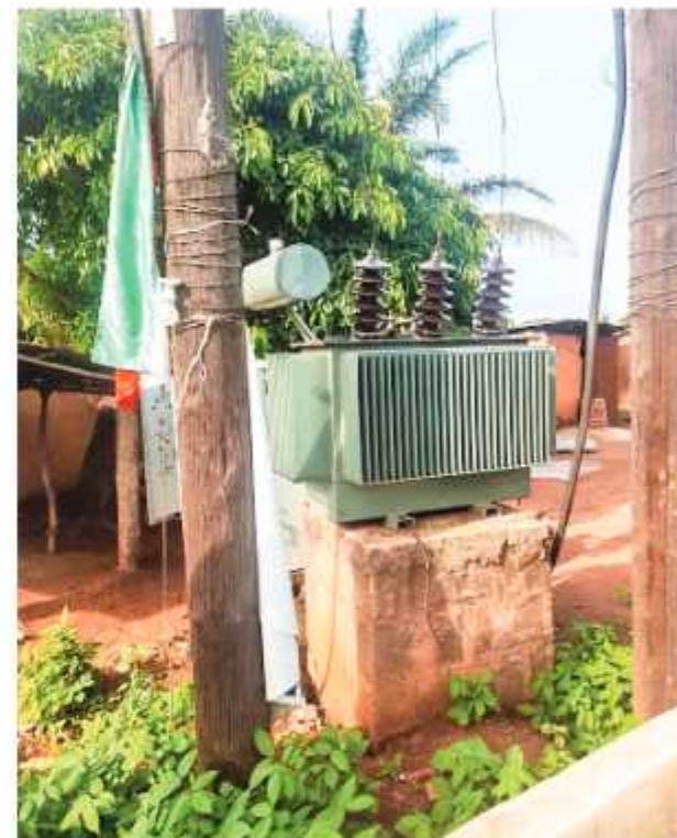
Supplied transformer to some communities in Otukpo/Ohimini Federal Constituency, Benue State (Amount: N15m)

To improve the narrative of Benue state, projects should be awarded to only contractors with a track record of quality implementation, and allocated funds should be released on time. This will reduce the trend of abandoned projects by contractors who claim inadequacy of released funds.