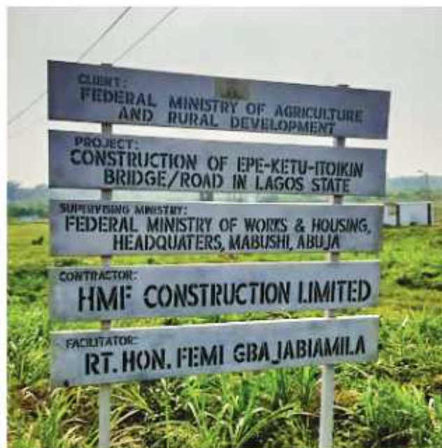
Signpost indicating Epe-Ketu-Itokin Road, Lagos State where Honourable Gbajabiamila Femi and Ministry of Agriculture and Rural Development are both claiming facilitation (Amount: N3.51bn)

This misinforms the public, and can be deemed fraudulent. MDAs should maintain independence while overseeing and commissioning projects. Case in point: Completion of Epe-Ketu-Itokin Road and Bridge Construction Work (ERGP554002022), was touted as sponsored by Honourable Femi Gbajabiamila (Surulere Federal Constituency), whereas the MDAs maintain full independence over the nomination and execution of FCPs.