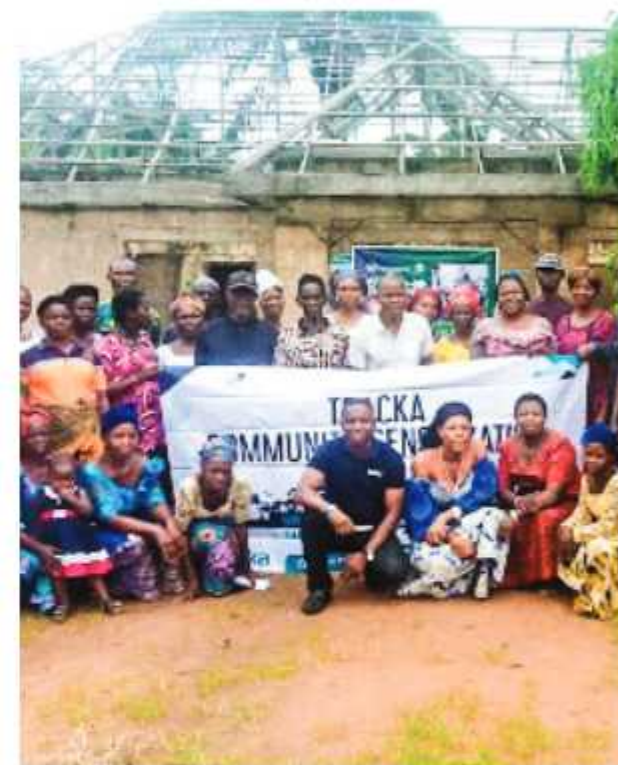
Town hall engagement with the residents of Ugbawka in Nkanu West LGA before the intervention on the health project (Amount: N25m)

For FCPs, we realised an upward trend in duplicated projects as 12% of projects were duplicated with separate amounts allocated for the same project. An example is Rehabilitation Of Agbani-Nara-Nkerefi -Ebonyi State Border Road In Enugu State (KM 10+400-KM14+800) (ERGP12154998) for N100m reappeared in the same budget