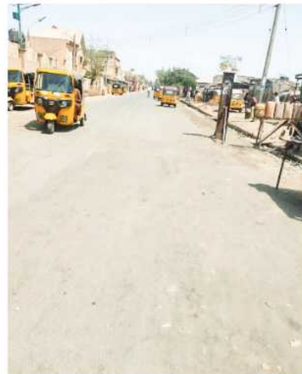
Less than 1Km Dan Fulani road at Tarauni LGA (Amount: N50m)

Also, exorbitant amounts were budgeted for basic projects as was the case in the rehabilitation of Dan Fulani Road Babangiji in Tarauni Federal Constituency where N50m was budgeted for a less than 1KM road work.