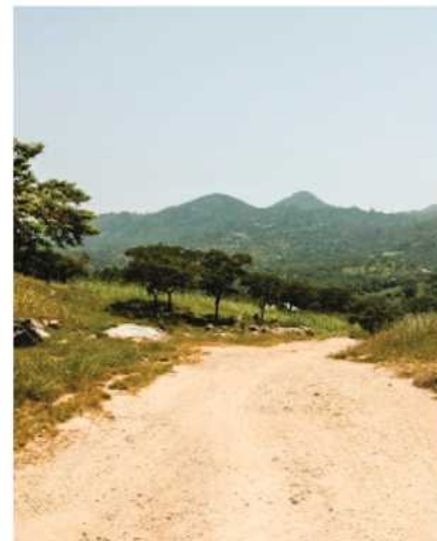
The abandoned Pankshin-Ballang-Nyelleng-Sara-Lere-Gindiri Road in Plateau State(Amount: N105m)

However, some road projects have been abandoned with contractors lamenting non-availability of funds to complete the projects.