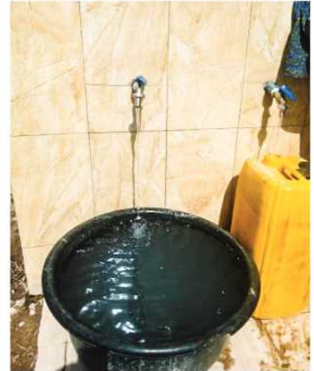
The revived Misheli borehole through our advocacy under Ardo-kola/Karim lamido /Lau Federal Constituency (Amount: N20m)

While Taraba may be 'nature's gift to the people', politicians should desist from seeing government projects as their personal gifts to citizens; they are not opportunities to accrue wealth to themselves nor opportunities for political patronage. Consequently, lawmakers should provide timely project updates to citizens, CSOs and other stakeholders. They should also prioritise robust communication with these stakeholders and respond to request for updates.