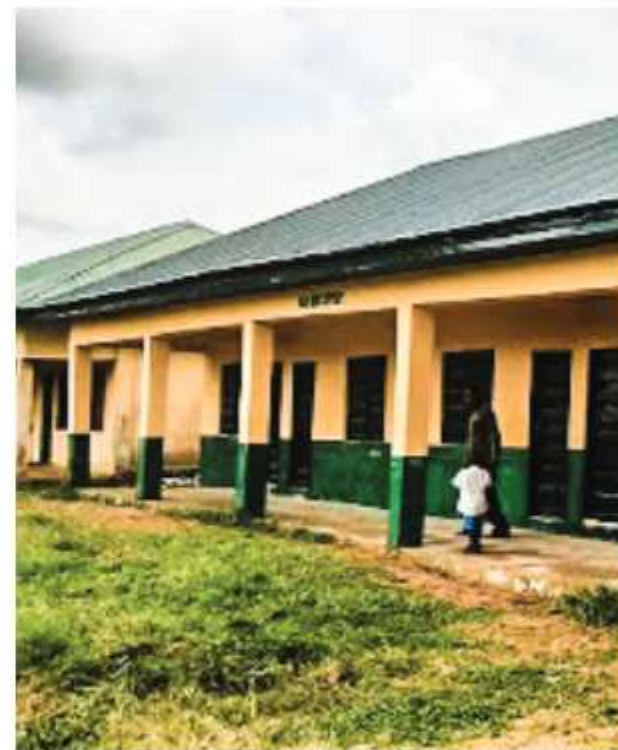
Completed but unused classrooms in Methodist Primary School, Oruko, Urue Offong LGA (Amount: N20m)

Despite this abysmal project performance in the state, there is a silver lining: we noticed more openness from the contractors implementing projects as they provided updates on the project implementation status.