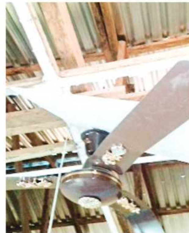
Barely six months after renovation, rooftop of Agu Ugwu Health Centre was destroyed (Amount: N40m)

If positive measures are not taken soon with reference to proper project execution, 'the salt of the nation', as Ebonyi is called, may soon lose its taste. To prevent this, political stakeholders and federal lawmakers in the state should prioritise capital projects in the next ZIP budget. This will block loopholes arising from empowerment projects and ensure that government funds are tailored towards sustainable projects with wider impact.