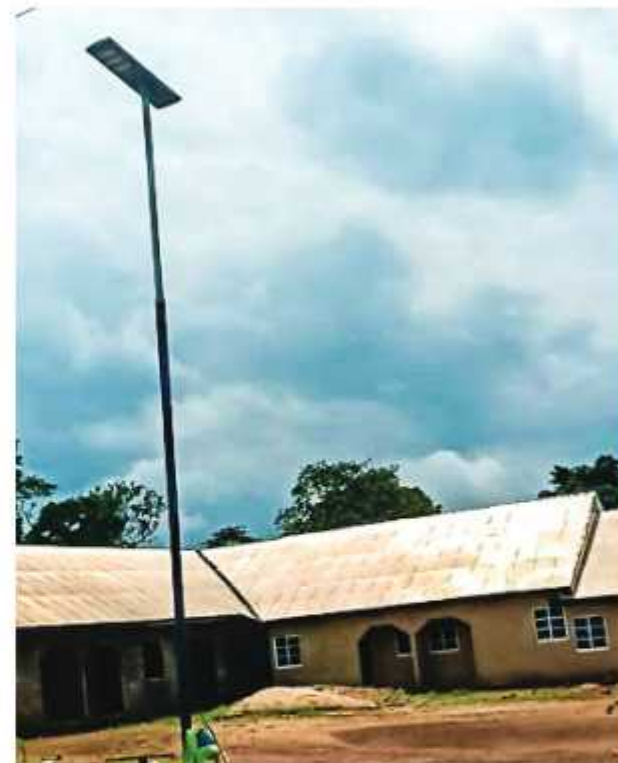
One of the solar streetlight projects; 20 of these were supplied for N50m.

These mechanisms should create a cycle for constant feedback before the budget item is listed, during and after project execution. This will bridge the communication gap and ensure there is a robust feedback loop among all stakeholders to ensure quality service delivery.