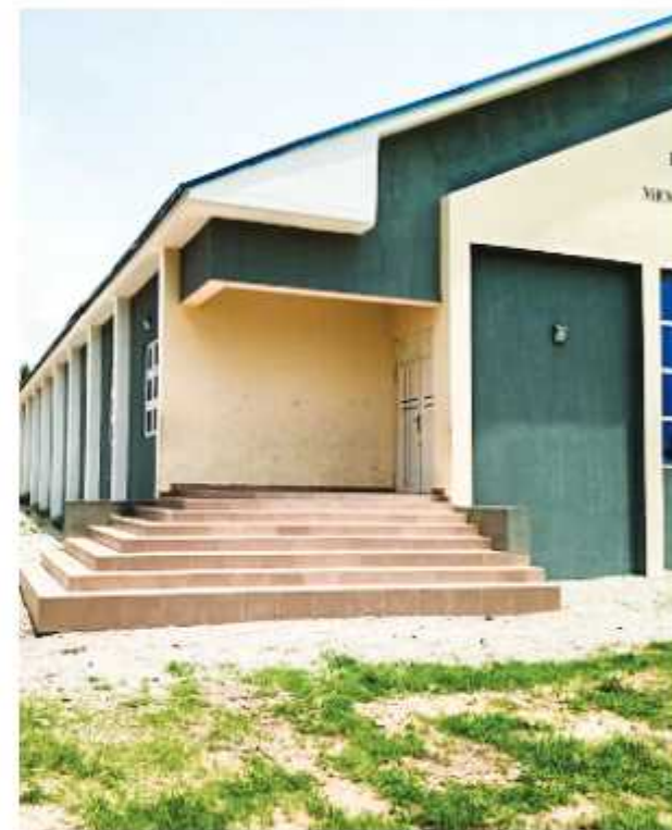
Newly constructed Mararaba Townhall, Donga LGA, Taraba State, named after Senator Emmanuel Bwacha (Amount: N100m)

There were several cases of project abandonment, a N40m project on the Construction Of Earth Dam At Sabon Pegi Zing LGA, Taraba State (ERGP7112926) is yet to be implemented after a contractor, Pro XL Civil Engineering Ltd, was paid N17m in April 2021 (information retrieved from www.govspend.ng ) for the study and design of the earth dam. Pro XL Engineering visited the site, but till date, over 250, 000 people in Sabon Pegi Zing are left with no source of clean water.