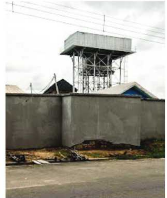
The completed Abonema water project in Rivers State (Amount: N90m)

Also, the Niger Delta RBDA needs to improve its project completion rate, and set up a proper communication system to provide the public with detailed information on project implementation activities. Only then will Rivers not just be at the base while measuring the impact of projects on the people but will indeed live up to its name as the treasure base of the nation.