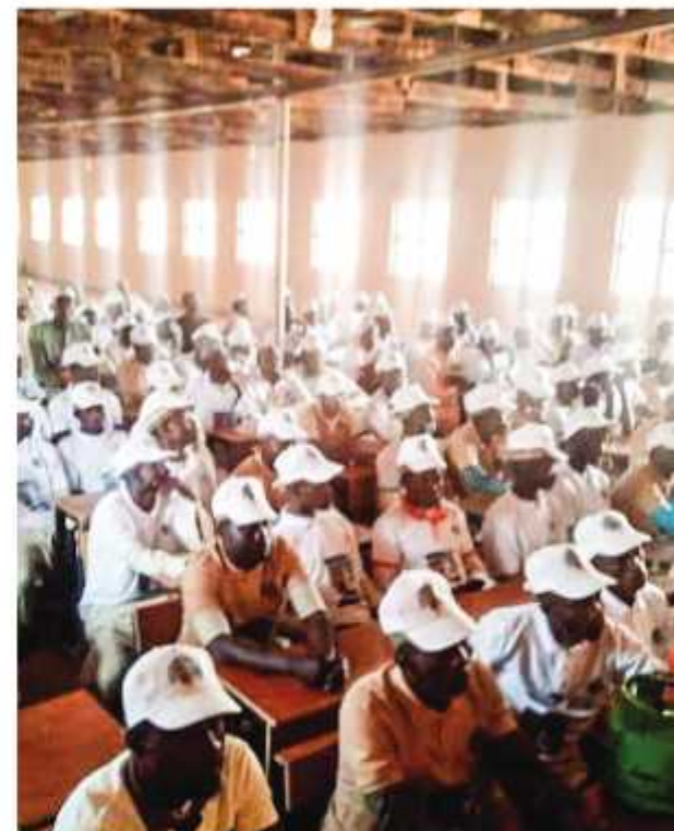
Training and empowerment of youths in Yabo/Shagari Federal Constituency, Sokoto. (Amount: N40.9m)

For the execution of a N40.9m titled Supply Of Fertilizers (NPK) To Kebbe/Tambuwal Federal Constituency, Sokoto State (2021ZIP1441)–Honourable Bala Kokani, the lawmaker representing the constituency, Honourable Bala Kokani, kept the items locked in his house. ICPC raided the property and supervised the distribution of the items to citizens.