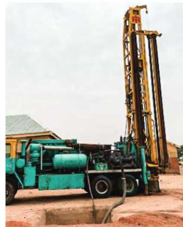
Shongo, Sarkin Yaki stalled water project (Amount: N50m)

Some projects were nominated two years in a row with different amounts, yet they have not commenced. It was observed that some of the projects captured in ZIPs were also captured in ERGP projects with different sums budgeted for them. An example is a N147m project– Construction Of Blocks Of Three Classrooms With Office And Furniture In Selected Areas Of Gombe North Senatorial District Of Gombe State (2021ZIP0439) under Universal Basic Education. In the Federal Consolidated Projects, N200m was budgeted for the same project under the same ministry and agency.